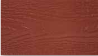
COUNTRY RED 6" LAP