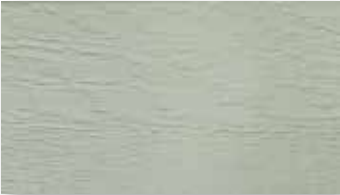
SAGE 6" LAP