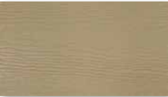
KHAKI 6" LAP