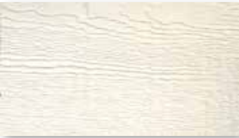
WHITE 6" LAP • 8" LAP