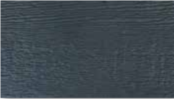
LAVA GRAY 6" LAP