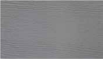
SILVER DOLLAR 6" LAP