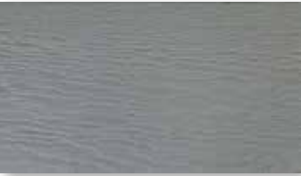
HARBOR GRAY 6" LAP • 8" LAP