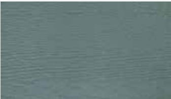
CHALKY BLUE 6" LAP