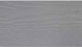
PHOENIX FOSSIL 6" LAP • 8" LAP