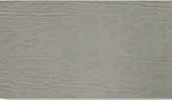
MIST GRAY 6" LAP • 8" LAP