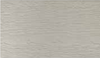
SANDSTONE 6" LAP