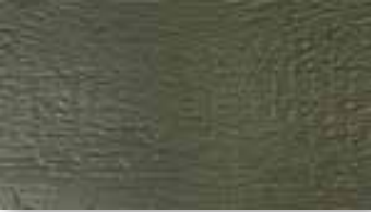
PLUNGE POOL 6" LAP