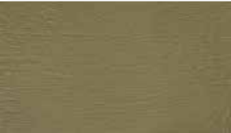
WALNUT 6" LAP