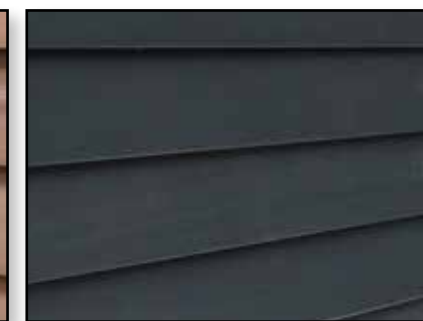
Finished – Lava Grey