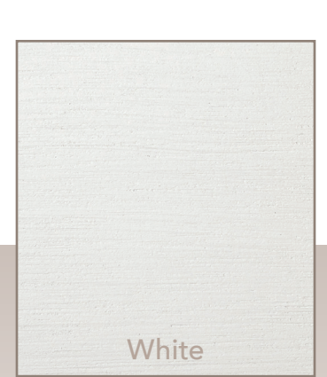
Colors shown are for reference only. Please refer to actual color samples before ordering.